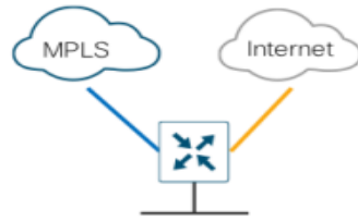
Single-Router Hybrid Design Model